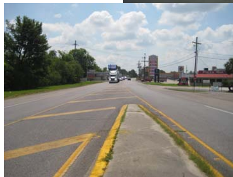
Hwy 1 at 4-Lane under Hwy 90