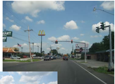
Hwy 1 near Wal-Mart