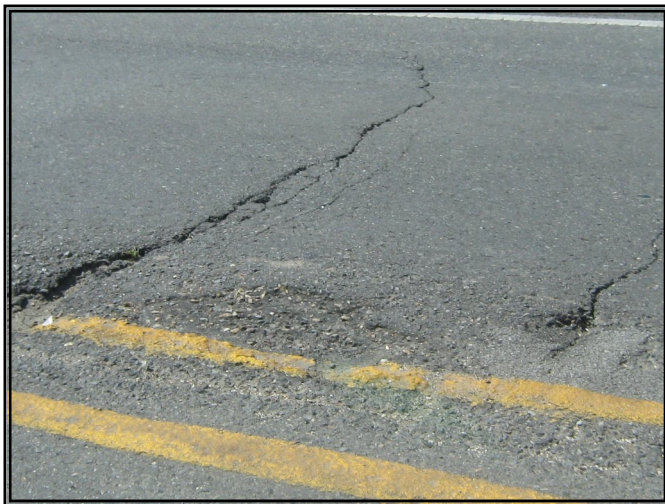
Potholes and cracks in existing roadway will be repaired through this overlay project.