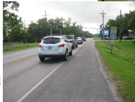
Eastbound LA Hwy 1