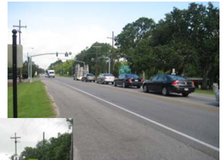
Westbound LA Hwy 1