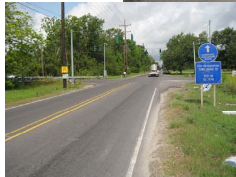
Eastbound LA Hwy 308