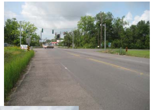
Southbound Tiger Dr